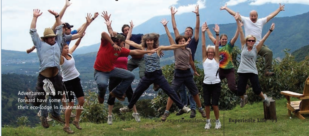
Adventurers with PLAY It Forward have some fun at their eco-lodge in Guatemala.

For more information on altruism and health, visit www.whygoodthingshappen.com and www.actsofkindness.org , or read "For a Good Cause" in the January/February 2002 archives at experiencelifemag.com .