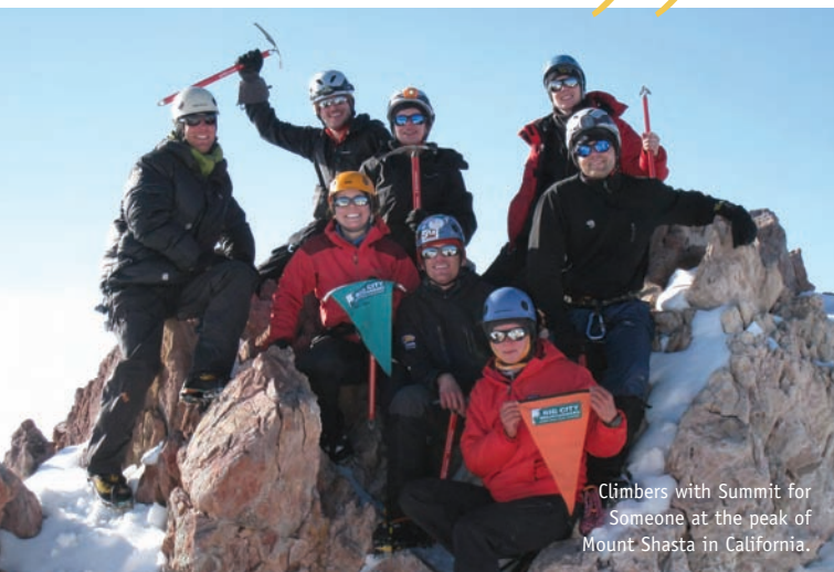
Climbers with Summit for Someone at the peak of Mount Shasta in California.

“You raise money for a great cause, your guided climb is free except for travel costs, and you receive all the equipment you need.”